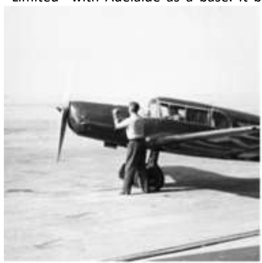
BFW 108b Messerschmitt Taifun, with Nobby as pilot

Guinea Gold was formed in 1926. The company operated in New Guinea, using various types of aircraft, mainly for air freighting to support its gold mining operations. As a "No Liability" company it was prohibited from carrying passengers, so in October 1927, a separate air unit was formed, registered as "Guinea Airways Limited" with Adelaide as a base. It began operations on the Adelaide to Darwin