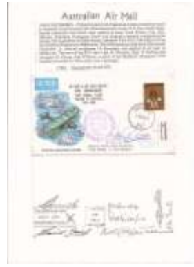
Commemorative mail with Nobby's signature vertically bottom right

The following month he was involved in the commemoration of the 1919 Vimy flight from England to Australia. The 1919 flight was the first to carry mail over that route.